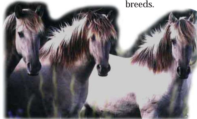
Sorraias; many Kigers are also listed in the Sorraia studbook.

The term "Iberian Horse" refers to any horse that is a descendent from the horses that originated from the Iberian Peninsula in Spain. The Sorraia, a primitive wild horse, contributed to the beginnings of both the Andalusian of Spain and the Lusitano of Portugal, among other breeds.