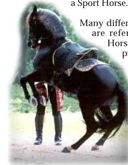
JP Giacomini's Lusitano Stallion, Hipo

The Sport horse has been known in the past as a horse that can excel in dressage, stadium jumping and cross country. However, with the induction of Reining into the Olympics, views are changing. A horse that can compete at a performance level, especially being versatile, is now being considered a Sport Horse.